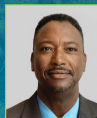
Winston Wooden Supervisory Committee Volunteer